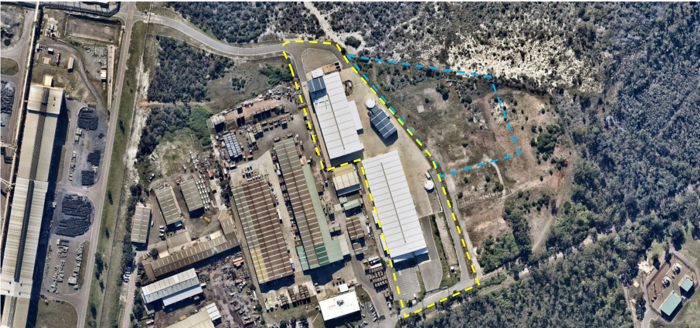
Figure 1 Project footprint

The names and contact details of the key personnel responsible for the environmental and compliance management of the Facility are listed below in Table 1.